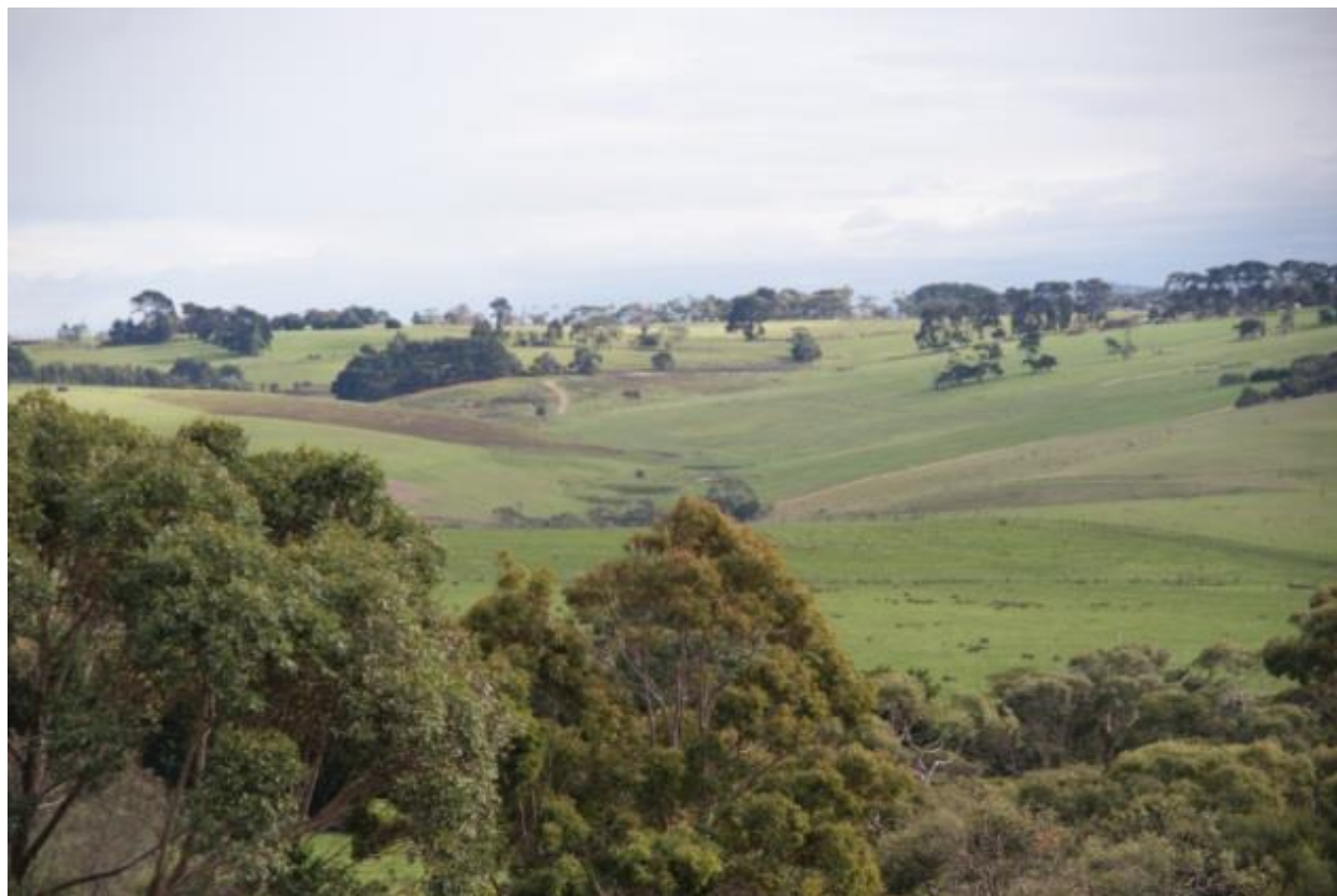
IMAGE: The Spring Creek Valley on the Surf Coast.