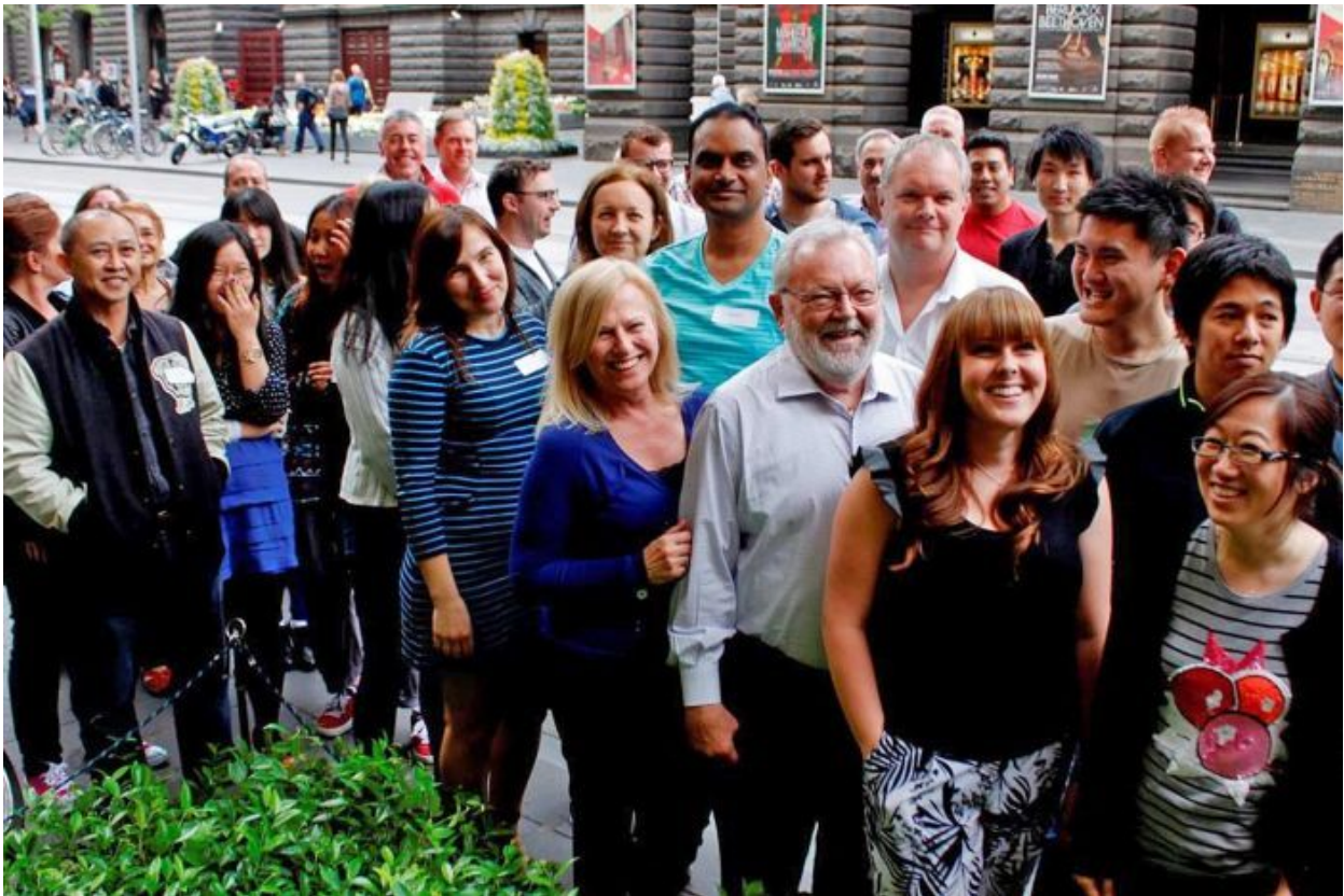
IMAGE: Members of Melbourne's People's Panel Outside City Hall.