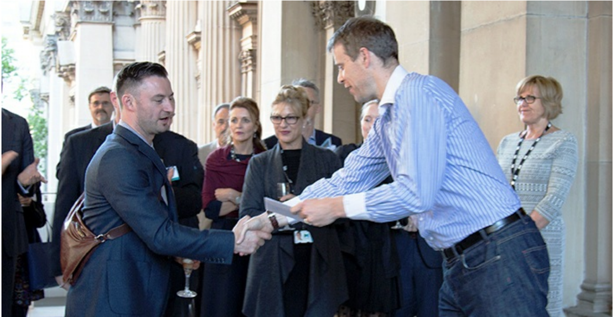
IMAGE: The People's Panel presented its recommendations to Council at a special Future Melbourne Committee on Monday 17 November 2014.